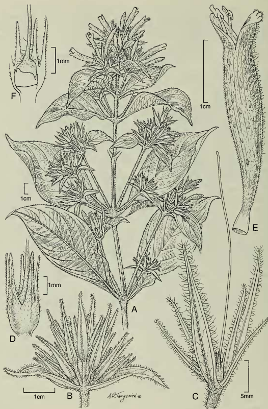
Fig. 2. A–F, Dicliptera purpurascens (Wasshausen 2007). A, Habit; B, Pedunculate cymes; C, Inner bracts, bracteoles, calyx and pistil; D, Calyx and pistil; E, Corolla; F, Nectar disk, pistil and calyx lobes.